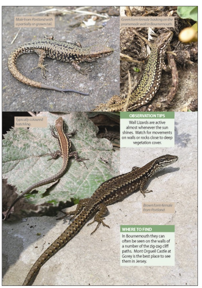
Wall lizard photographs

including the tail, and to get as much of it in focus as possible. So check the AV settings on your camera, as this will help you juggle with depth of field, and practice using a monopod for a bit of stability in the field.