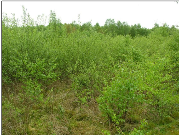
A 'heathland' reserve in Cheshire.

Lack of management has to be addressed at nature reserves; heathland continuity is crucial in Adder conservation terms; the feast or famine management regime which goes from scrub saturation to scrub clearance degrades the habitat.